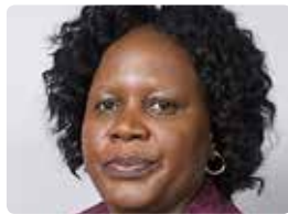
Hon. Nomalungelo Gina Chairperson Portfolio Committee Basic Education